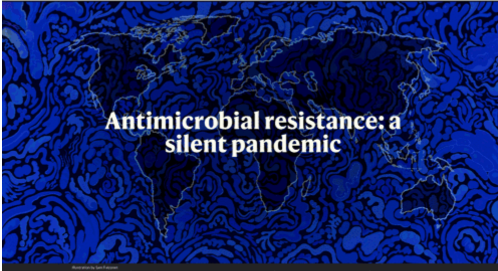
Illustration by Sam Fildes